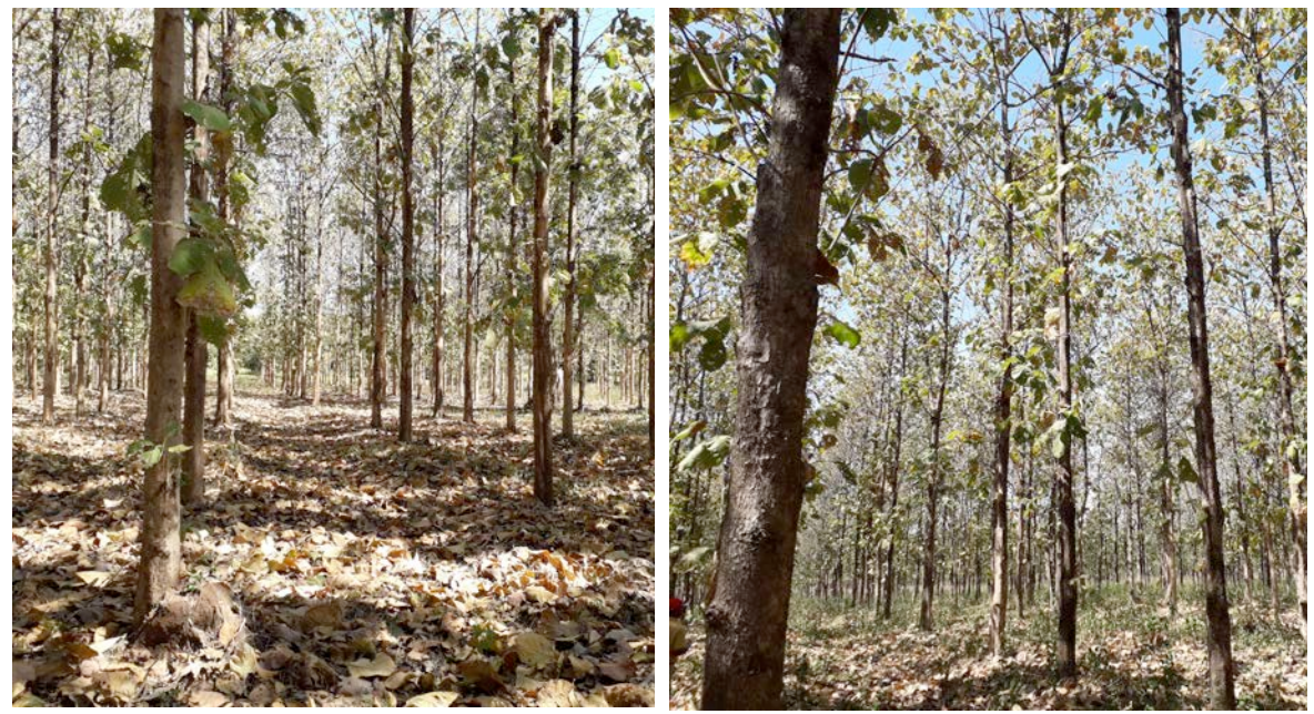
Figure 21: Majority of stems have defects, such as longitudinal checks, flutes, protuberances in A,D,E Blocks in Kaochanoke-T group