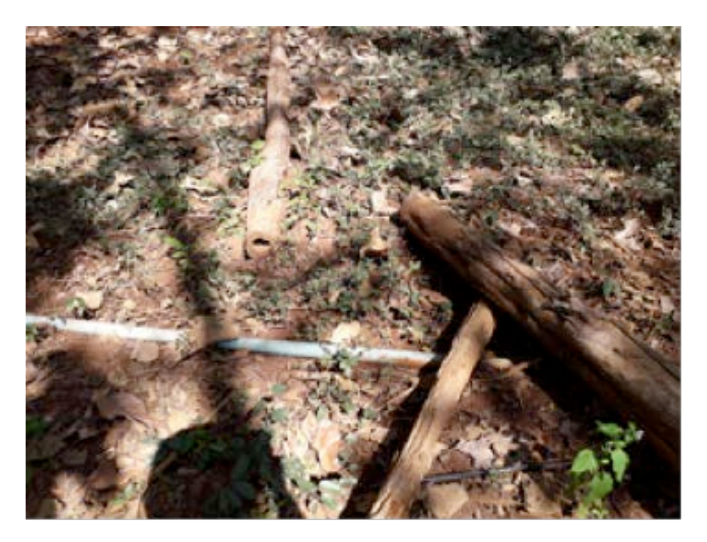
Figure 9: Due to wood debris laying plantation ground, infestation of termite may damage to the tree root system which result to slowdown growth of tree or some time die the tree with subsequent attraction of fungus