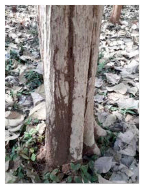
Figure 8: Termite invading the teak stem

Figure 9: Due to wood debris laying plantation ground, infestation of termite may damage to the tree root system which result to slowdown growth of tree or some time die the tree with subsequent attraction of fungus