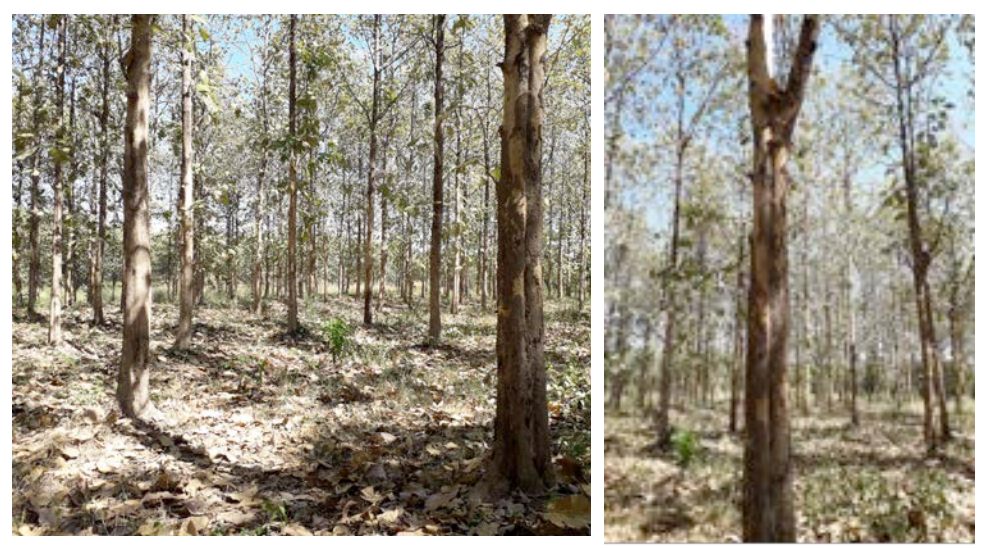
Figure 20: Majority of stems have defects, such as longitudinal checks, flutes, protuberances in A,D,E Blocks

Results and observation of block no. A, B, D and E of Kaochanoke-T group