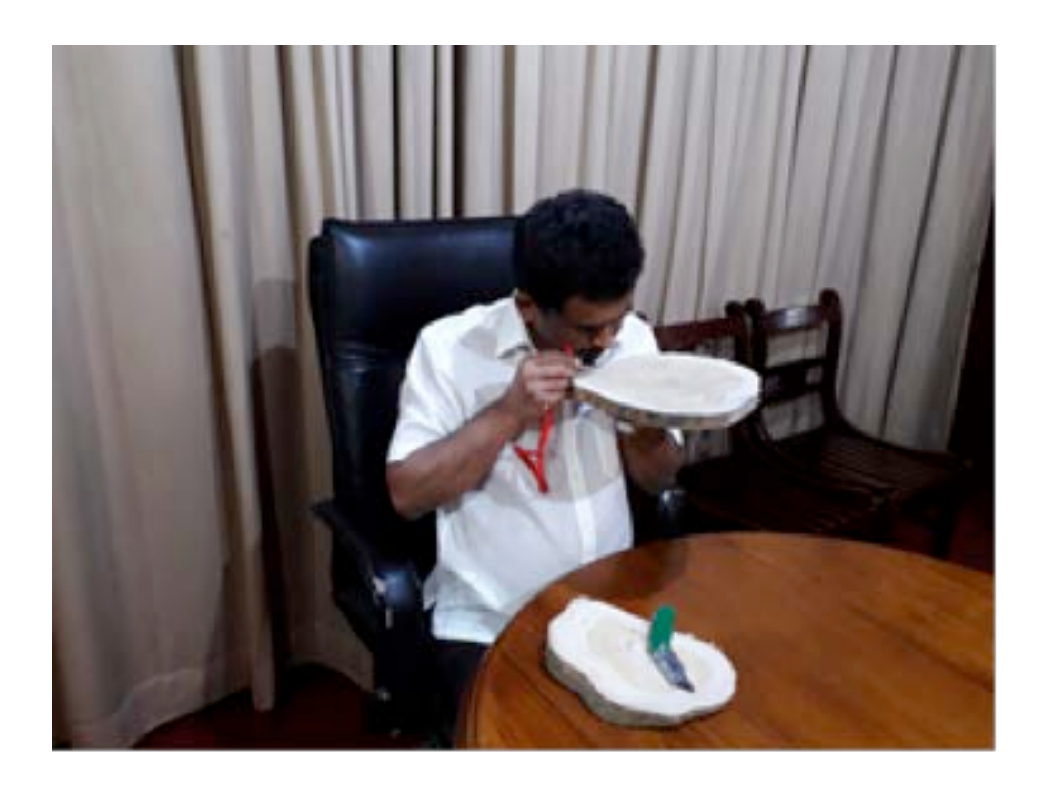
Figure 15: Counting annual rings of teak timber disc