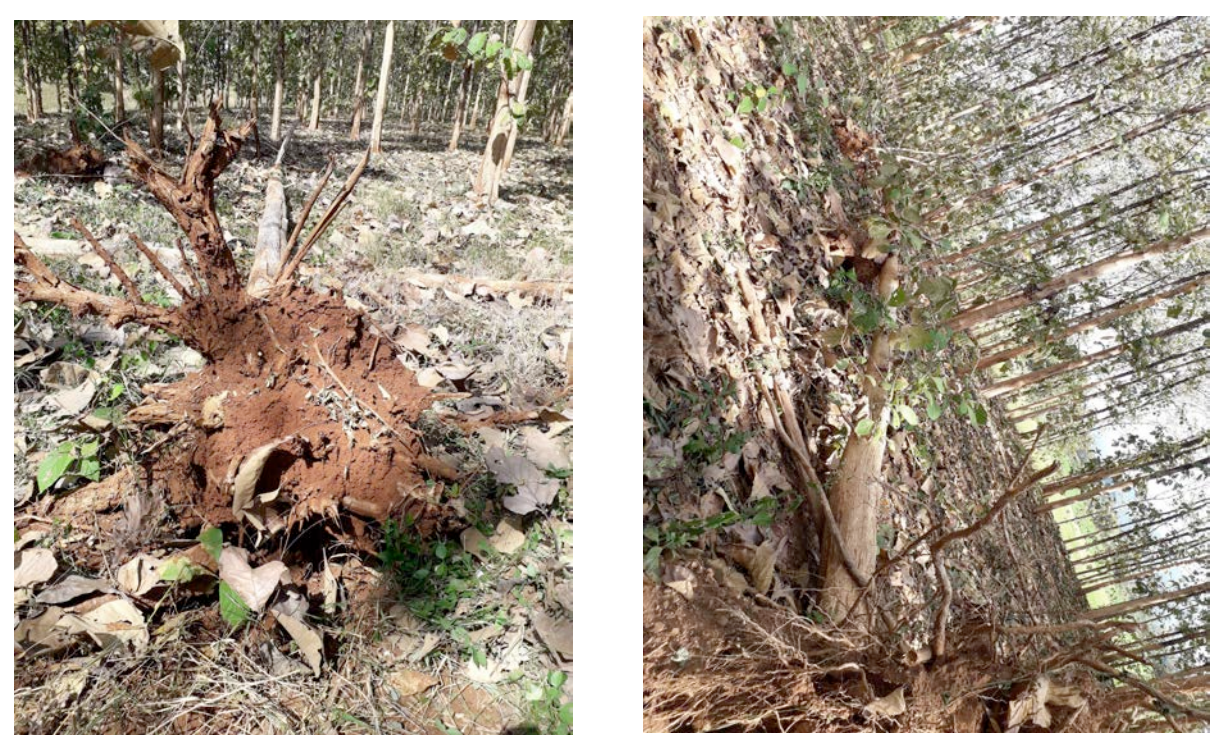
Figure 6: Few trees were observed by uprooted due to wind or shallow root system or roots might be damaged by fungus.