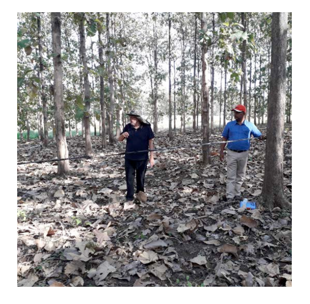
Figure 3: Circular plot of 500m<sup>2</sup> used to find number of trees/ha

Dr.Nimal Ruwanpathirana (BSc(bio sci.) M.Sc.(forestry) PhD(wood Science and forest management)