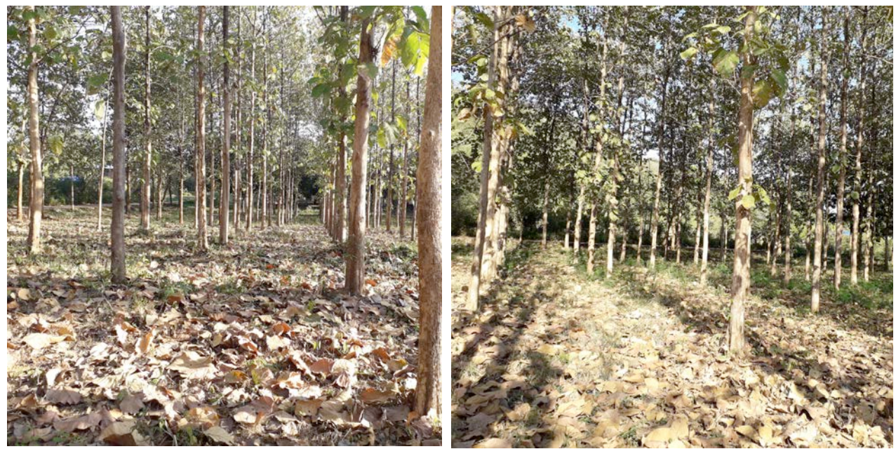
Figure 18: Ground level view of Chon Daen 224 estate. Dry leaves may results the surface fire.