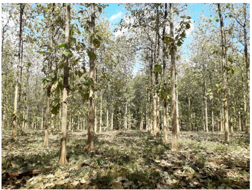
Figure 5: View of Chon Daen 1 Teak Estate