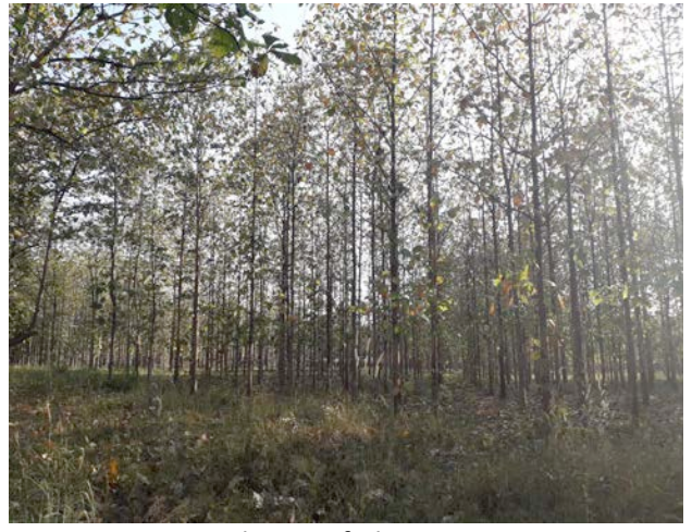
Figure 16: General view of Chong Daen 224 estate

Results and Observations of Block No:1, 2 and 3 Chon Daen 224 estate