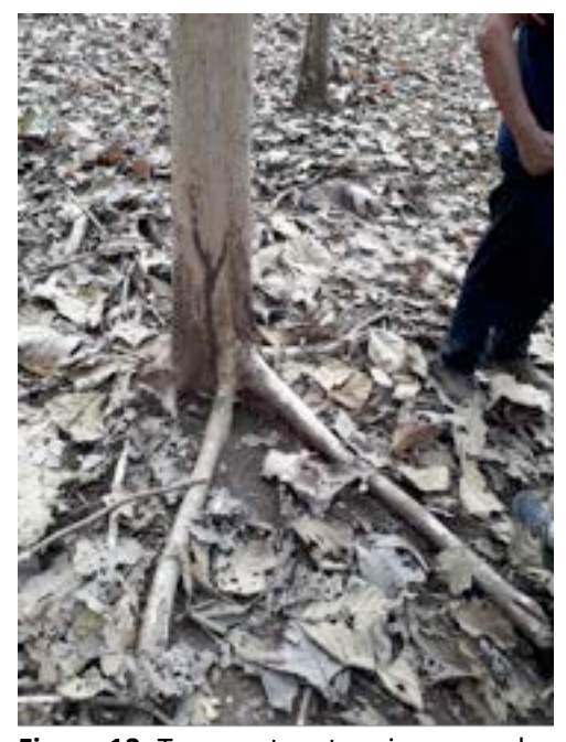
Figure 12: Harrowing the site between tree rows for Figure 13: Tree root system is exposed. improving the soil condition turns into the soil erosion