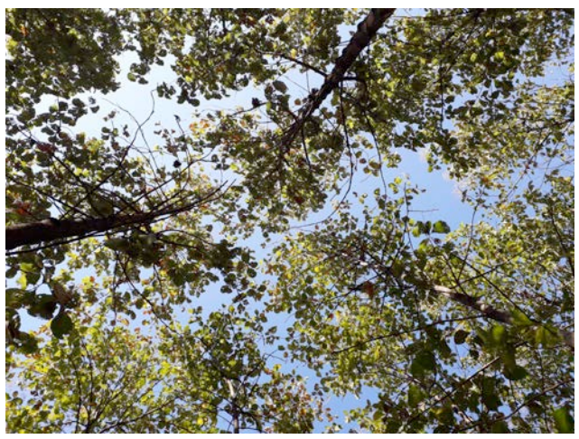
Figure 17: View of forest canopy, still no canopy competition