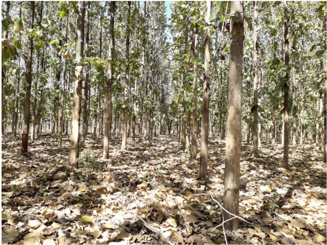
Figure 23: General view of block B which is comparatively better than block AD and E in Kaochanoke-T group. However this plantation also found 45% trees are good, 40% trees are moderate and 15% trees are damage