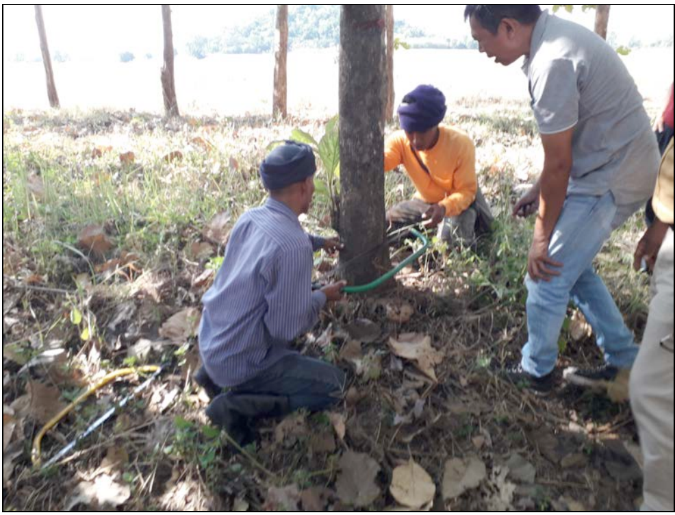
Figure 14: Dead/ Poor(weak)/ thin(whip)/ broken / badly form stem/ diseased or when more number of trees per ha than to standards, should be removed from bottom of tree (6 inches above ground level) not from upper part of stem