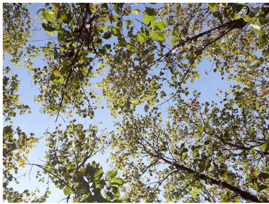
Figure 24: View of canopy in block B in Kaochanoke-T group