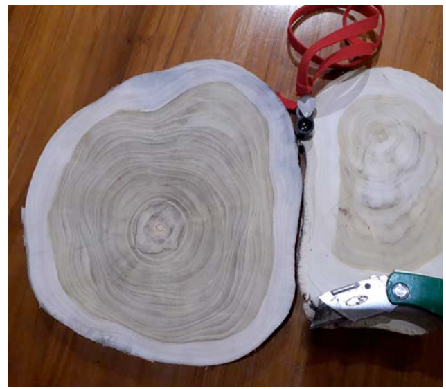
Figure 2: Cross section of timber taken from teak plantation in CD1 which contain 68.45% heartwood and CD224 contain 40.6% heartwood in Thailand