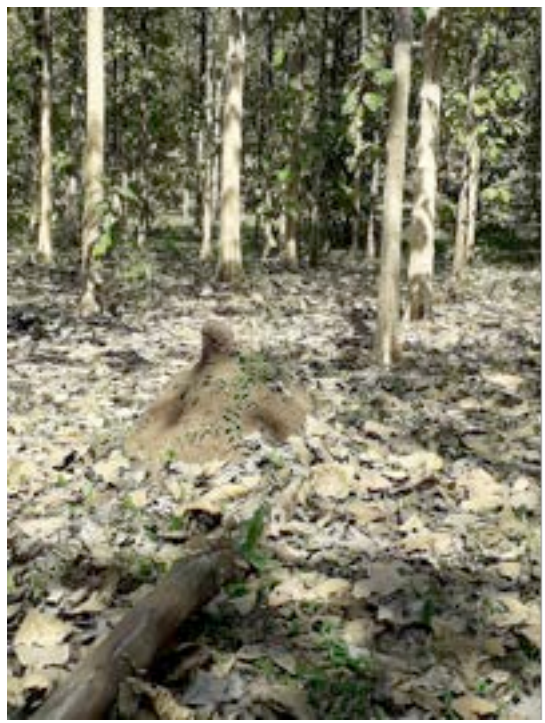
Figure 7: Termite colony in plantation site