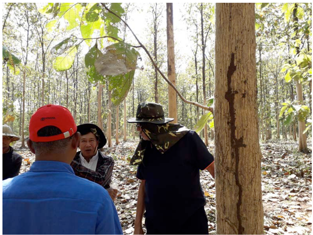
Figure 10: It is recommended to prune the adventitious shoots up to at least 4-5m to get more knot free timber production.