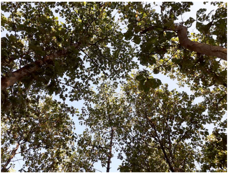
Figure 11: Canopy is not closed or there are no competition among the branches of upper canopy in many areas of the plantation hence thinning is only recommended where the canopy is closed.