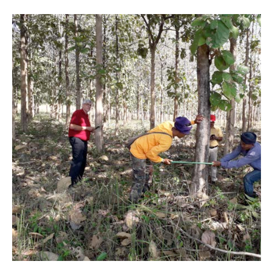
Figure 4: Marking trees for thinning left without removing from site, which was cut for collection of wood samples.