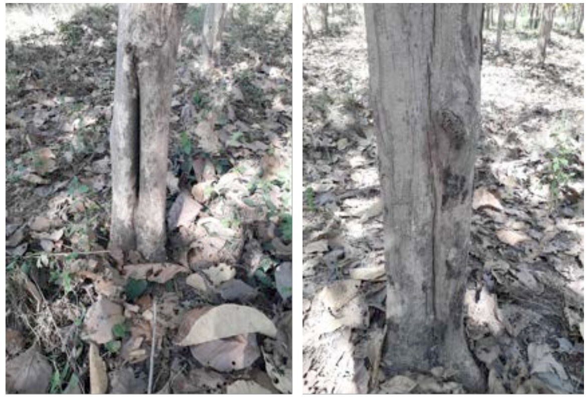
Figure 22: Major defects in first log of tree stem in Block A,D and E in Kaochanoke-T group