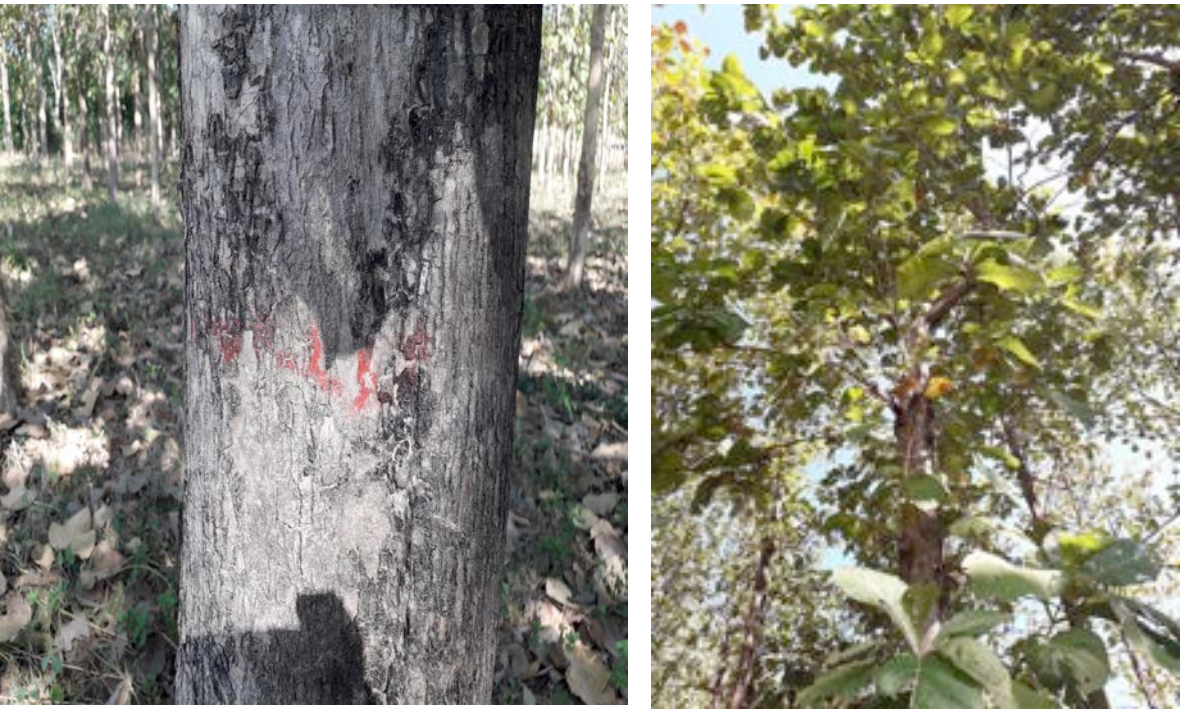
Figure 19: Red demarcation mark indicates that this tree has been marked for thinning but it has not happened yet.